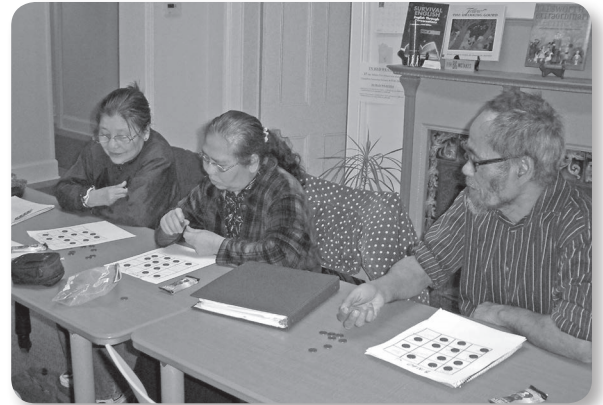
ESL students playing citizenship bingo.

14 TLP students became United States citizens in 2014. Their home countries were: Burma, China, Costa Rica, Laos, Russia, Tibet, and Ukraine.